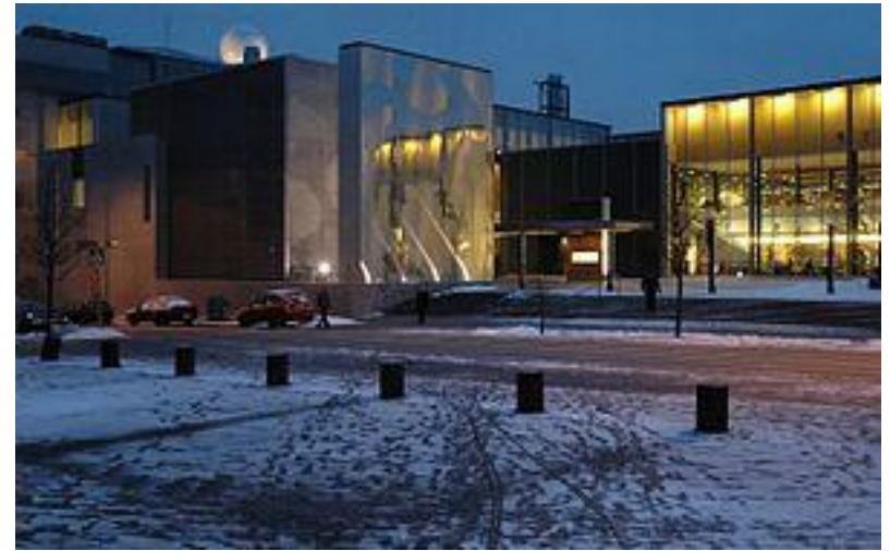
Kumpula Campus Physicum